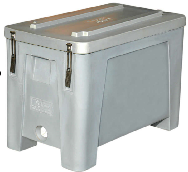
Option : Inner lid Caster base